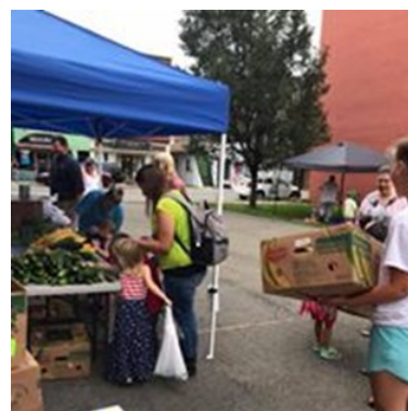
Kids’ Farm Market at Owego FRC

The Family Resource Centers supported healthy food choices for families through a variety of program options this year. Monthly Nutrition Exploration activities were offered at each site for families with young children to make and taste snacks featuring fruits and vegetables. Kids in the Kitchen series were held at each site to engage families with children in the school age range in learning food preparation skills and trying healthy recipes. Families engaged in learning about growing food through Seed to Supper activities at each site including tending a small container garden at the Waverly site. Summer meals were provided at Owego FRC along with Children’s Farm Market and Food Bank events to increase access to healthy food sources over the summer months when children are not in school. The children’s kitchen station is a favorite drop in play activity at both sites and provides opportunities for learning about healthy foods in the context of child directed play. Children have been observed making food choices opting for fruits and vegetables over less healthy options in the context of pretend play. Parents report providing healthier meals and increases in their children’s willingness to try healthier foods.