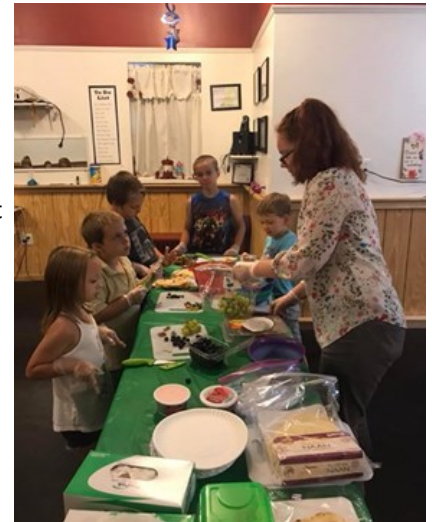
Kids in the Kitchen at Owego FRC.

The Family Resource Centers supported healthy food choices for families through a variety of program options this year. Monthly Nutrition Exploration activities were offered at each site for families with young children to make and taste snacks featuring fruits and vegetables. Kids in the Kitchen series were held at each site to engage families with children in the school age range in learning food preparation skills and trying healthy recipes. Families engaged in learning about growing food through Seed to Supper activities at each site including tending a small container garden at the Waverly site. Summer meals were provided at Owego FRC along with Children’s Farm Market and Food Bank events to increase access to healthy food sources over the summer months when children are not in school. The children’s kitchen station is a favorite drop in play activity at both sites and provides opportunities for learning about healthy foods in the context of child directed play. Children have been observed making food choices opting for fruits and vegetables over less healthy options in the context of pretend play. Parents report providing healthier meals and increases in their children’s willingness to try healthier foods.